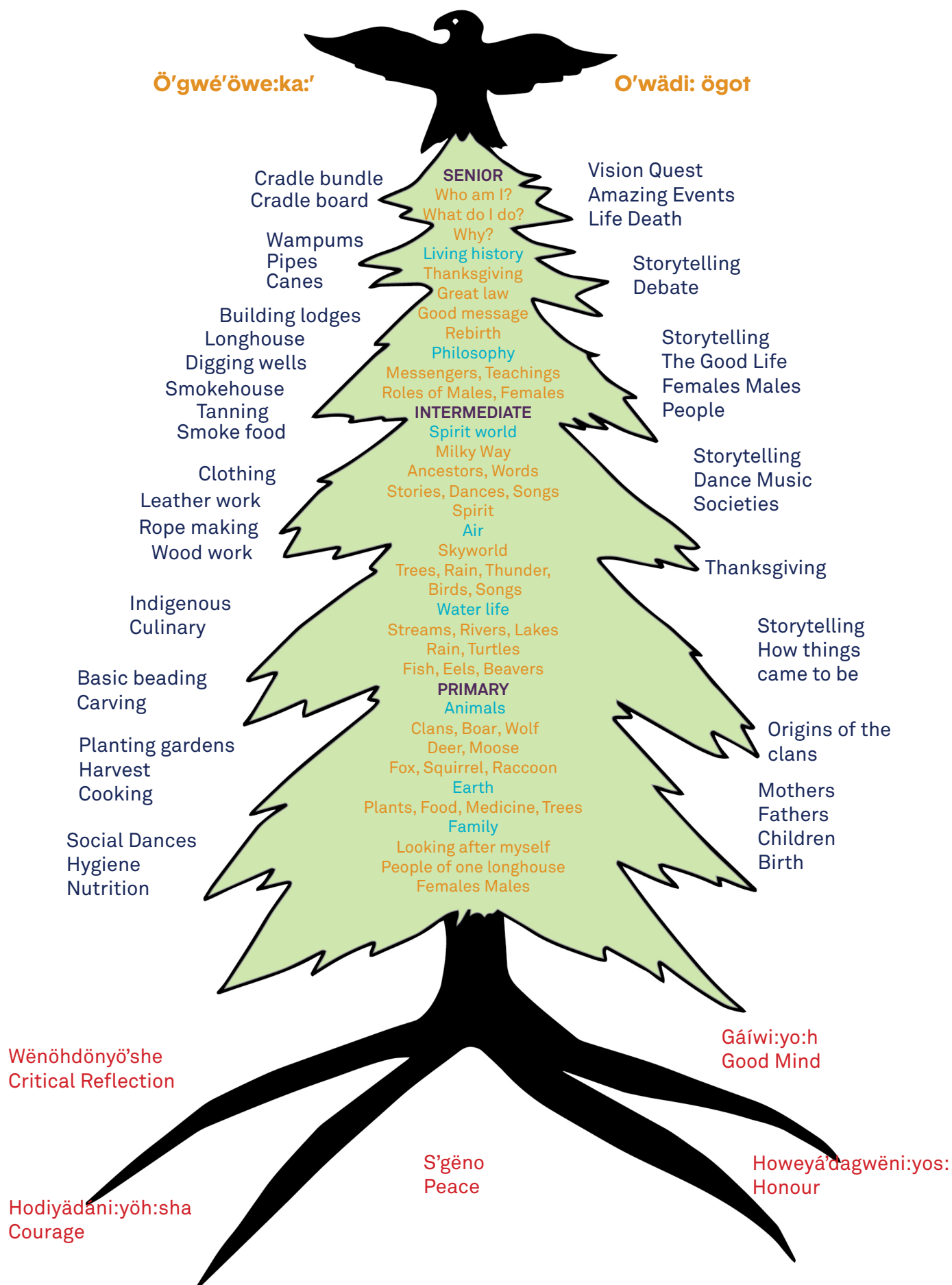
Figure 2: Onëhdaji'gowa:h (Tree of Great Peace)