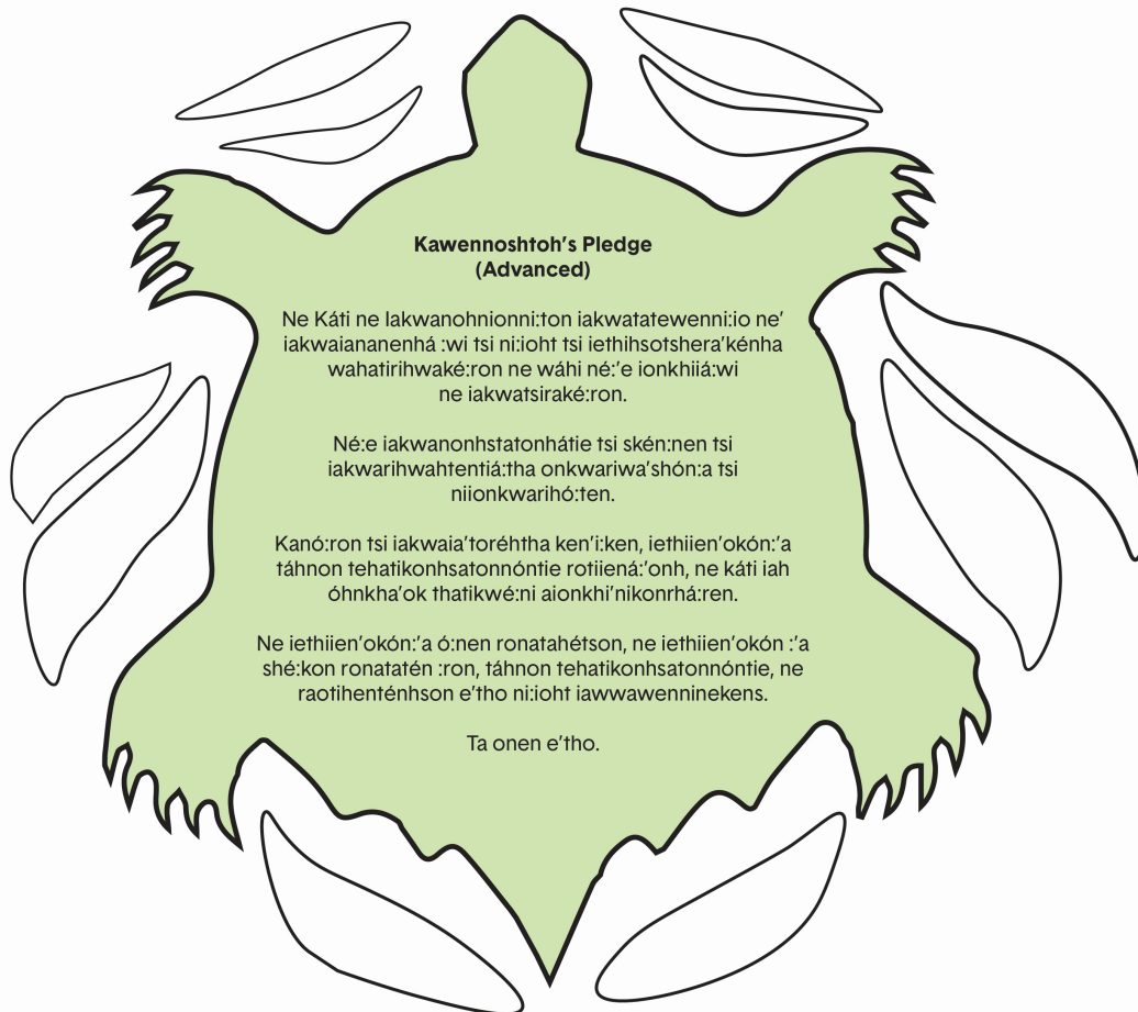
Figure 4. Kawennoshtoh's Pledge (Advanced)

The Teaching Seneca AQ guideline fosters the promotion, revitalization, resurgence, and sustainability of Haudenosaunee knowledge systems, cultures, and languages.