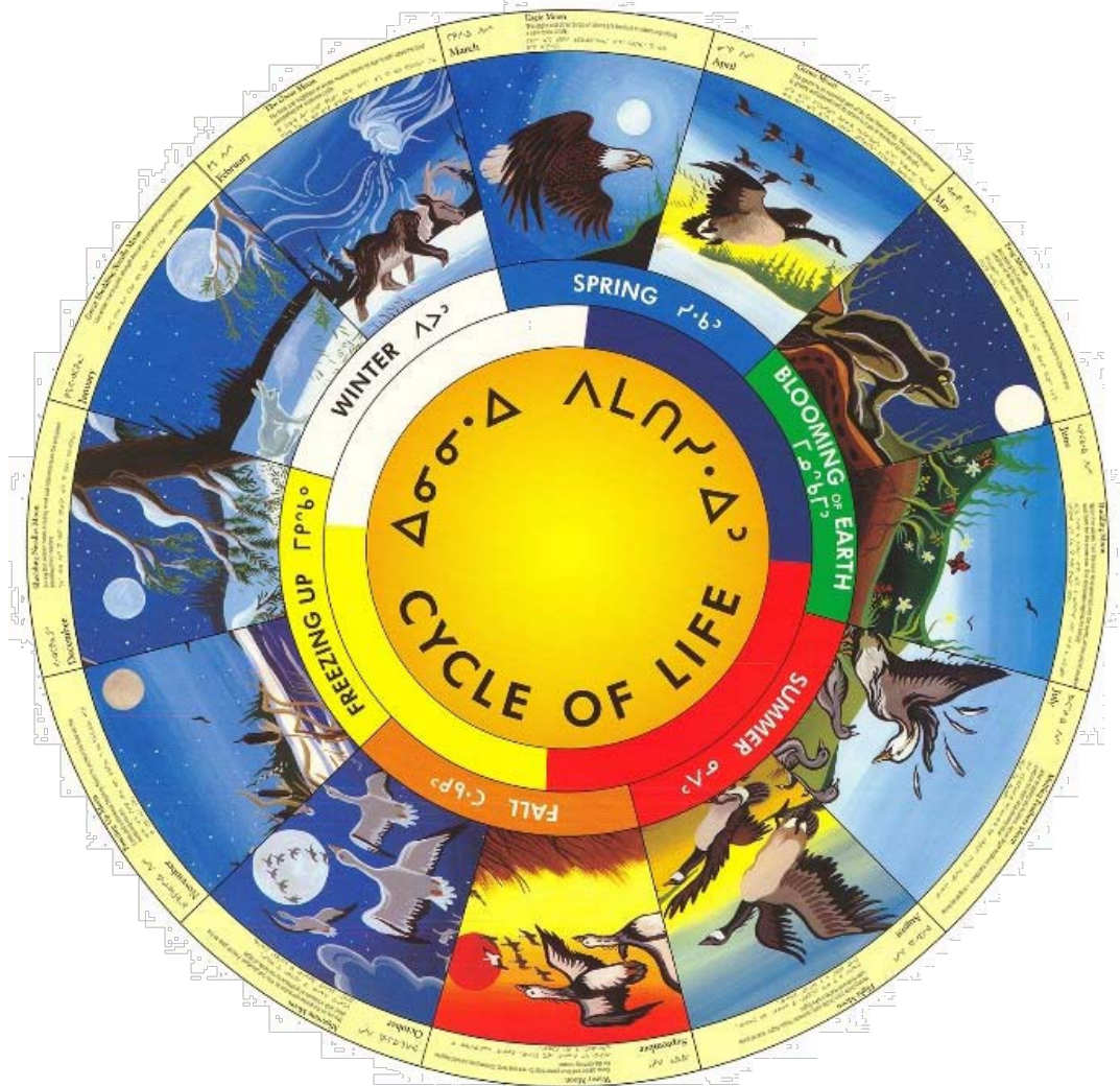
Cycle of Life

Schedule E – Teachers’ Qualifications Regulation January 2021