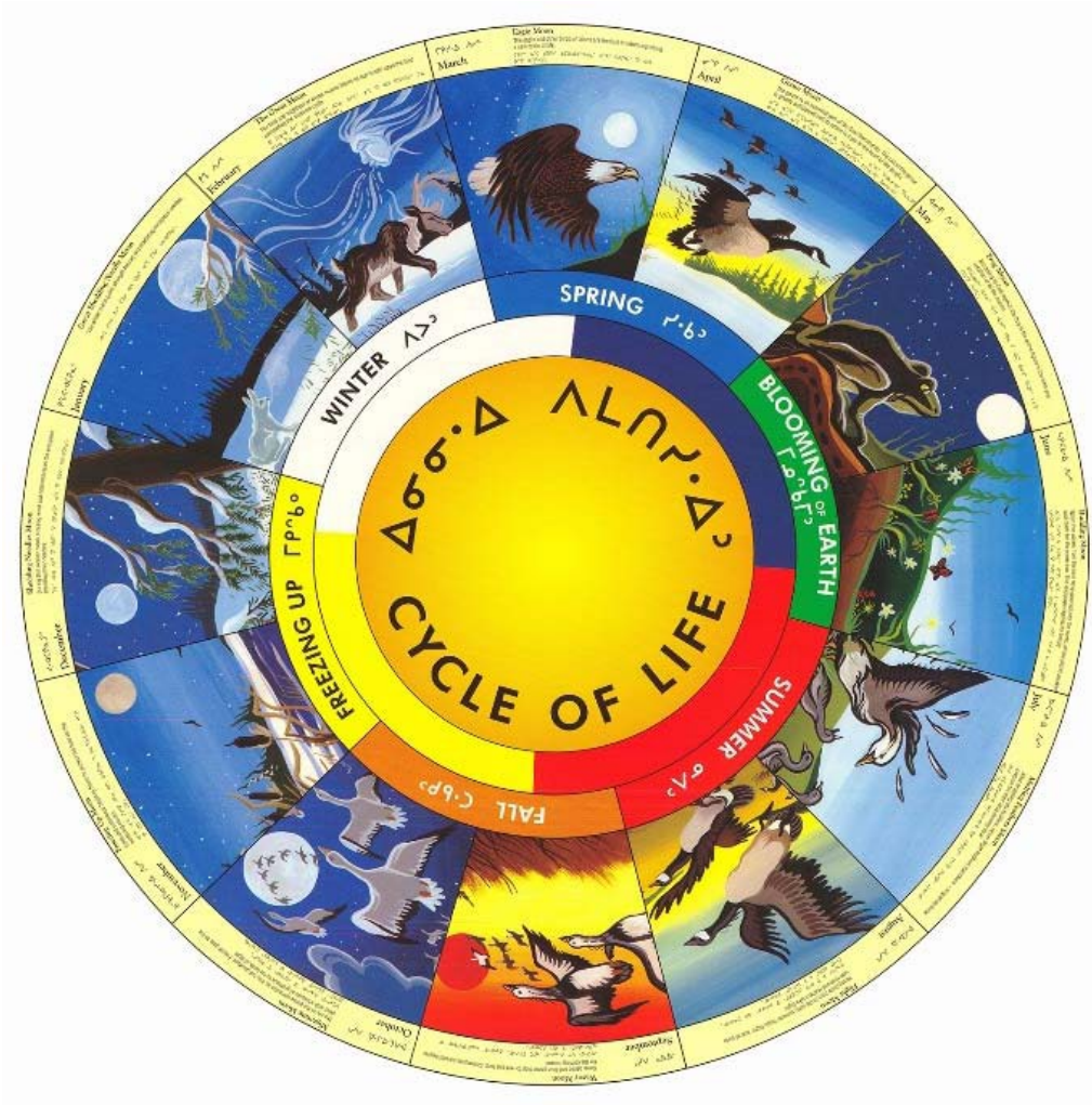
Figure 1: Cycle of Life