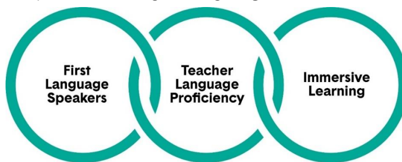
Figure 1: Important Context for the Development and Delivery of AQ Course

Stabilize language-loss to recover Haudenosaunee languages, which are believed by the Haudenosaunee to have been given to them by the Creator, is central to sustaining Haudenosaunee civilizations. Grounded in Haudenosaunee values and cultural knowledge – which is also inherent in the languages – Onondaga remains deeply rooted in Haudenosaunee history, territories, ceremonies, cultural practices, and way of life, which have transcended colonialism, including the residential school era. With this in mind, the following are included as additional considerations for the development and delivery of the AQ Course: Honour Specialist Teaching Onondaga (Figure 1 and 2):